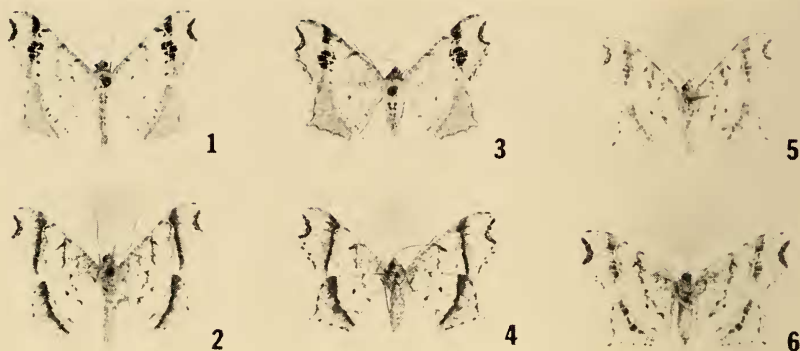
Figs. 1-6. Specimens: (1) Semiothisa promiscuata, n.sp., holotype; (2) same specimen, underside; (3) S. promiscuata, allotype; (4) same specimen, underside; (5) S. aemulataria (Wlk) ♂. Bog E of Big Indian L., Halifax watershed area, Nova Scotia, 27 June 1963, underside; (6) S. aemulataria ♀, District of Columbia (no date), underside.

(Natural History) from New York and "East Florida." I hereby designate as the lectotype the male, presumed to have been taken at Trenton Falls, Oneida Co., New York, and it is being so labelled. I have not seen this specimen, but in his description of it Walker said, "hind tibiae hardly incrassated." This precludes any possibility that it refers to the new species herein described. Also, the type locality as restricted is almost certainly too far north for this new species.